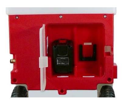
Storage hatch for 2 batteries